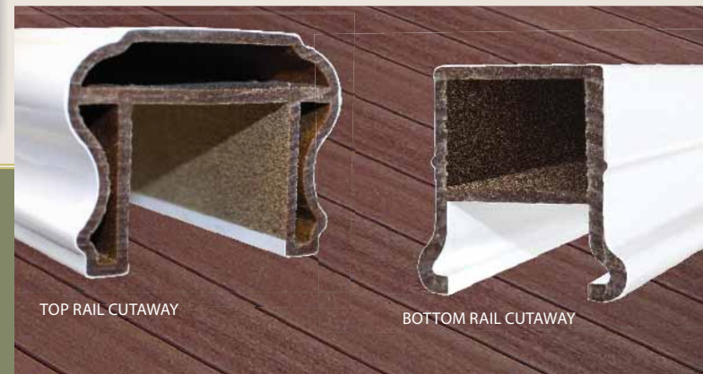
TOP RAIL CUTAWAY