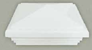
5-1/4" CLASSIC CAP