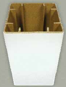
5-1/4" COMPOSITE POST SLEEVE 5-1/4" x 5-1/4" x 39" 5-1/4" x 5-1/4" x 48" 5-1/4" x 5-1/4" x 108"