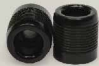
COMPOSITE POST SLEEVE