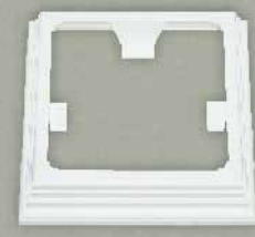
5-1/4" POST TRIM RING